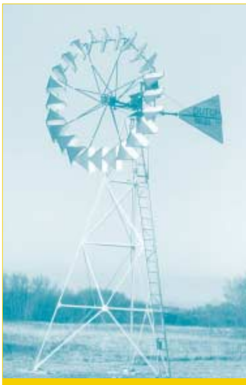
▲ Mechanical water pumping system.